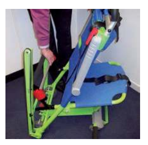
16. Fold the arms back and close the chair from the side by releasing the red locking mechanism on the track, push forward from the top handle and fold the chair together.