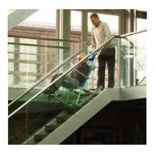
11. Manoeuvre the chair forward onto the top two steps, make sure the tracks stay in full contact with the stairs.