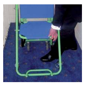
4. Holding on to the top of the chair pull down on the seat. Once the chair is open bring over the two arms. ATTENTION Please be aware that the arms are NOT WEIGHT BEARING and should be folded back prior to the user/client on exiting the chair.