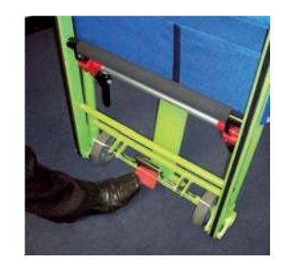
14. Ensure the brake mechanism is locked.