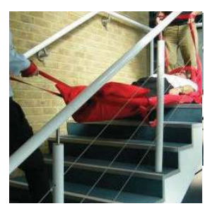
6. Once at the stairs, position 1 person at the rear and 1 person at the front, holding the handles.