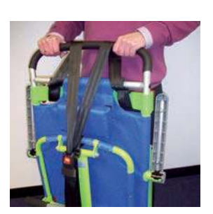
17. Pass the lower part of the support harness through the foot rest and connect to upper harness. Place chair back into storage location and replace protective cover.