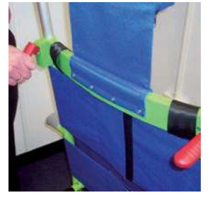
9. When in position, open the two red spring clips. This will allow the handle to be raised. Once raised, close the two red spring clips and ensure they have re-engaged, this will lock the handle in place.