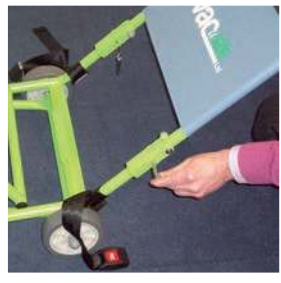
3. Unfold the handle and insert the safety pins on each side to secure.