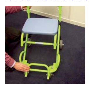
1. Fold foot rest back to closed position.