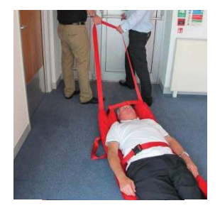
9. Once you are at ground floor level evacuate to final exit.

NB: If you are using the Premium Plus or Premium Adjustable Slider you may require more operators to assist.