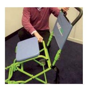
4. Hold the handle and locate the seat bar into the bracket on the rear frame.