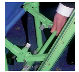
8. Pull the track back and pull the crossbar towards/upwards to you and close the spring clips. Ensure they have re-engaged by pushing down on the track unit.