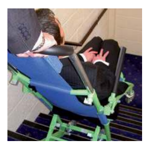
10. Hands are now placed on top of the handle, tilt the chair back and manoeuvre over the edge of the stairs.