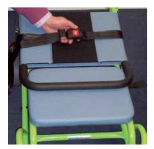
5. Fasten the safety belt around the folded chair.