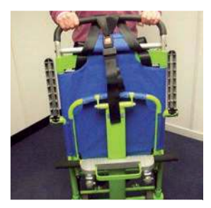
2. Remove the protective cover and place the chair on the ground in a suitable position.