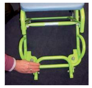
6. Fold out foot rest if required and fasten seat belt.