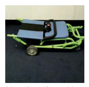
4. Lower down to the ground, into a folded position.