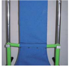
6. Close the spring clips and ensure they have re-engaged, this will lock the handle in place.