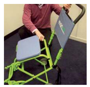
2. Hold the handle and remove the seat bar from the bracket on the rear frame.