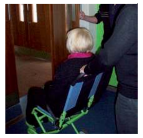
10. When you get to ground floor manoeuvre to final exit.