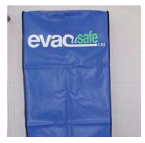
1. The chair should be located near to the exit it serves. It should be hung on the hooks provided or can be leant against a wall.