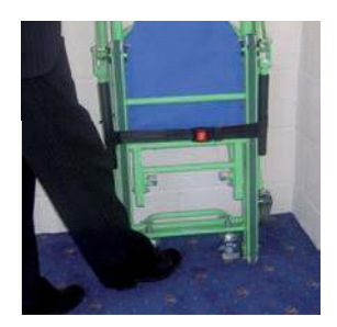
2. Remove the chair from the wall and place on the ground. Engage the footbrakes by pressing down on the foot pedals on BOTH brakes shown in the picture.