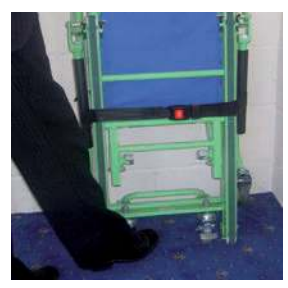
1. Ensure the footbrake is locked.