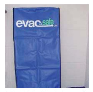
1. The chair should be sited near to the exit it serves. It should be hung on the hooks provided or can be leant against a wall.