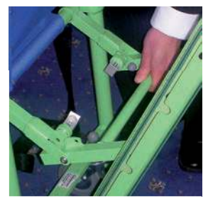
2. Undo spring clips on the track, close and lock.