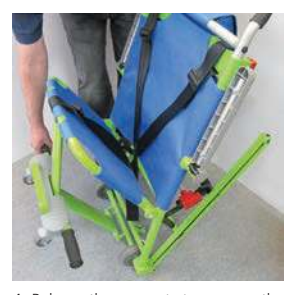
4. Release the support strap, open the chair from the side to a seating position, using the black handle and then ensure that it is locked into place, by pushing down on the bar with the two red locks.