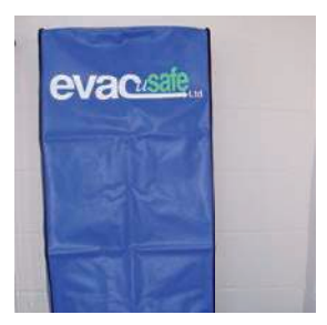
6. Place chair back in storage area and replace protective cover.