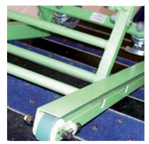
11. Keeping the tracks firmly in contact with the stairs, ensure a firm grip, apply downwards pressure on the handle and allow the chair to operate downwards.