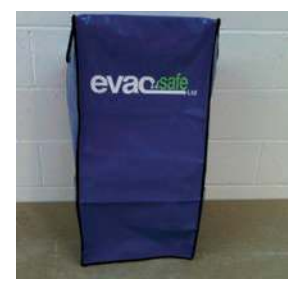
6. Return to storage position.

THE CHAIR CAN BE OPERATED USING 2, 3 OR 4 PERSONS THAT ARE SITUATED AROUND THE CHAIR.