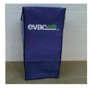
1. Remove chair from storage location and place on the ground in a suitable position.