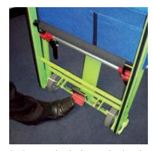
3. Engage the brake mechanism by pressing down on the red footpad shown in the picture.