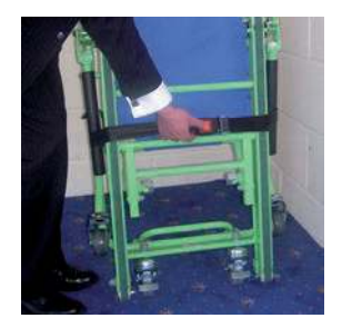
4. Fold back the arms. Close chair and fasten the seatbelt.