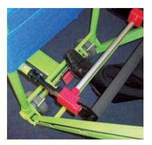
TO OPERATE THE CHAIR

7. Once the client is in the chair release the brake mechanism by placing your foot on top of the red footpad and push down.