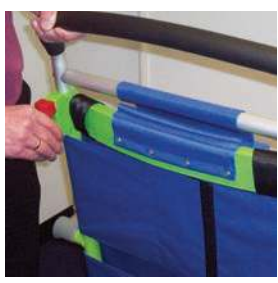
15. Undo the red spring clips on the handle and gently lower, close the red spring clips and lift the handle until it locks into place. Pass support harness through and over the handle.