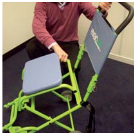
2. Hold the handle and remove the seat bar from the bracket on the rear frame.