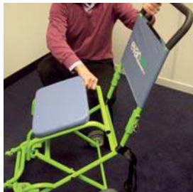
2. Hold the handle and remove the seat bar from the bracket on the rear frame.