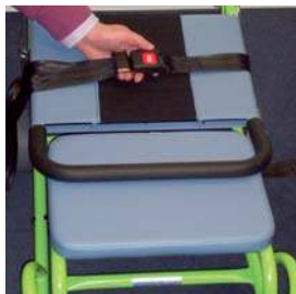
5. Fasten the safety belt around the folded chair.