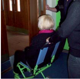
10. When you get to ground floor manoeuvre to final exit.