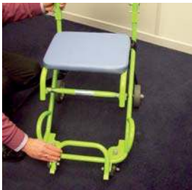
1. Fold foot rest back to closed position.