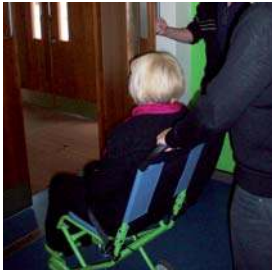
10. When you get to ground floor manoeuvre to final exit.