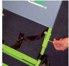
3. Remove the safety pins on each side of the handle and fold the handle down.