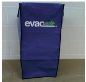
6. Return to storage position.

THE CHAIR CAN BE OPERATED USING 2, 3 OR 4 PERSONS THAT ARE SITUATED AROUND THE CHAIR.