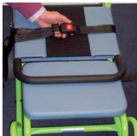
5. Fasten the safety belt around the folded chair.