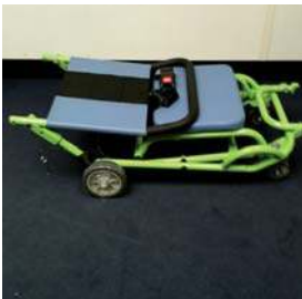
4. Lower down to the ground, into a folded position.